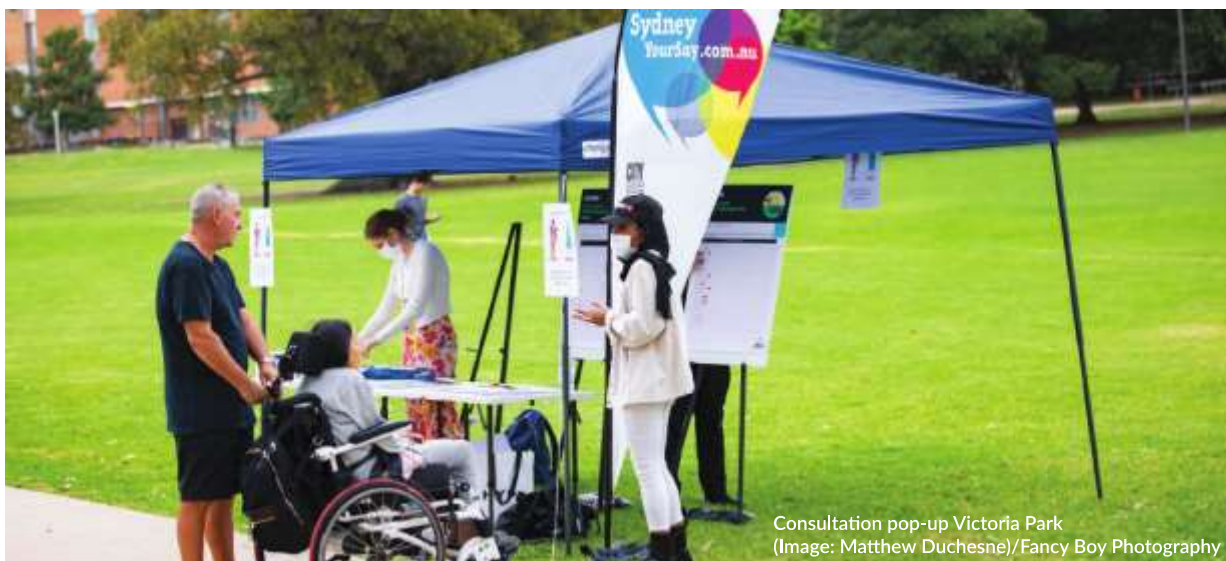
Consultation pop-up Victoria Park