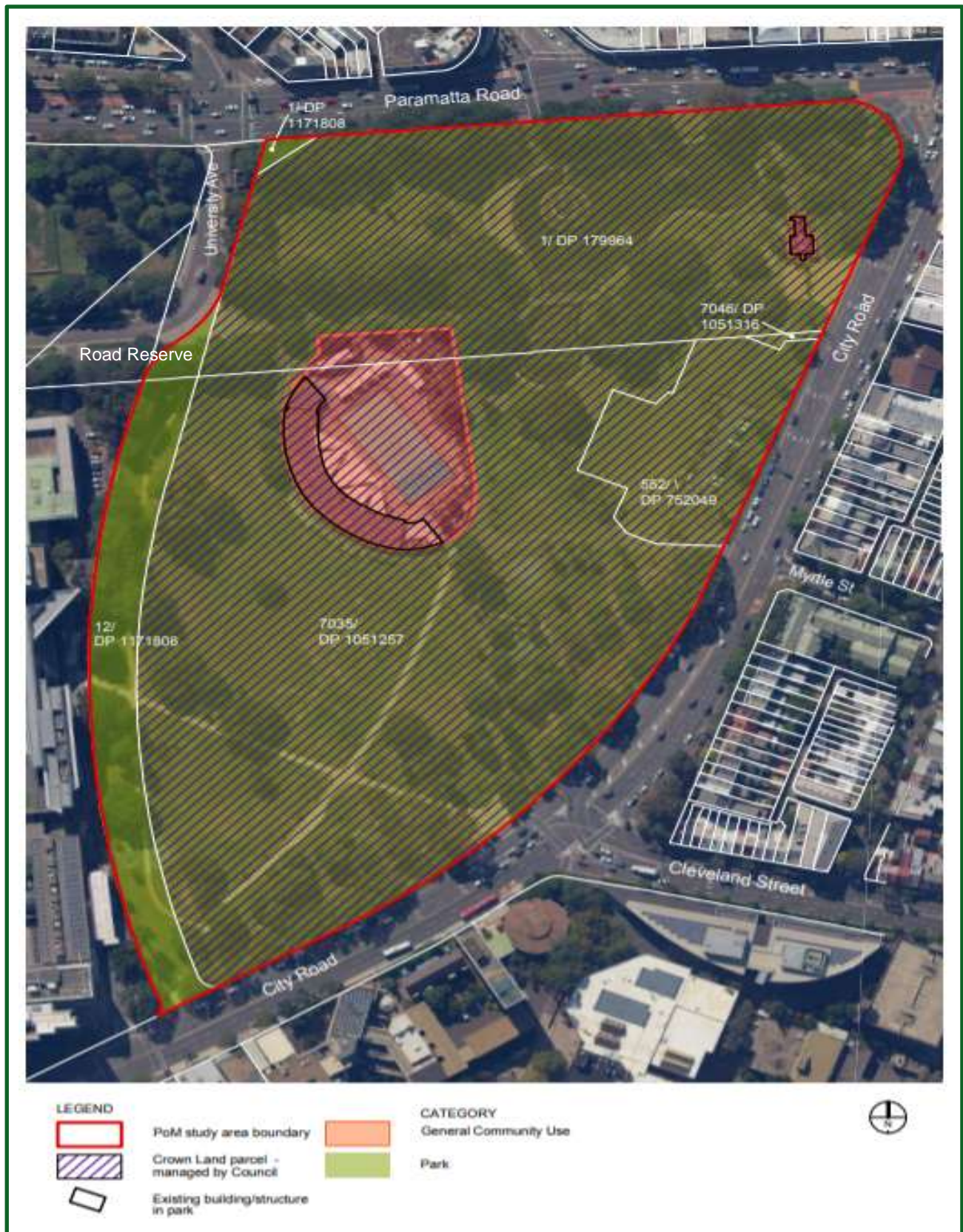
Figure 6. Community land categorisation map