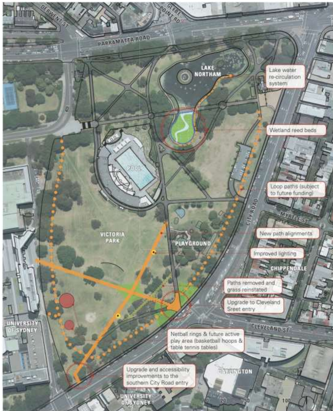
Figure 5. Strategic Plan