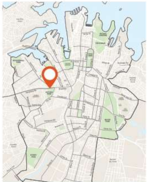
Victoria Park, Camperdown