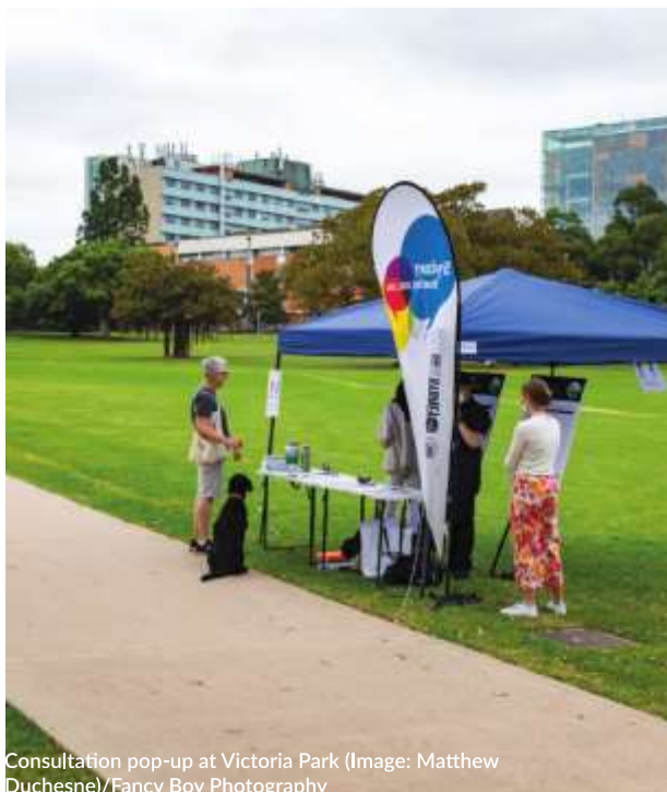
Consultation pop-up at Victoria Park

Participants also told us they value Victoria Park because of the pool and the festivals and major events.