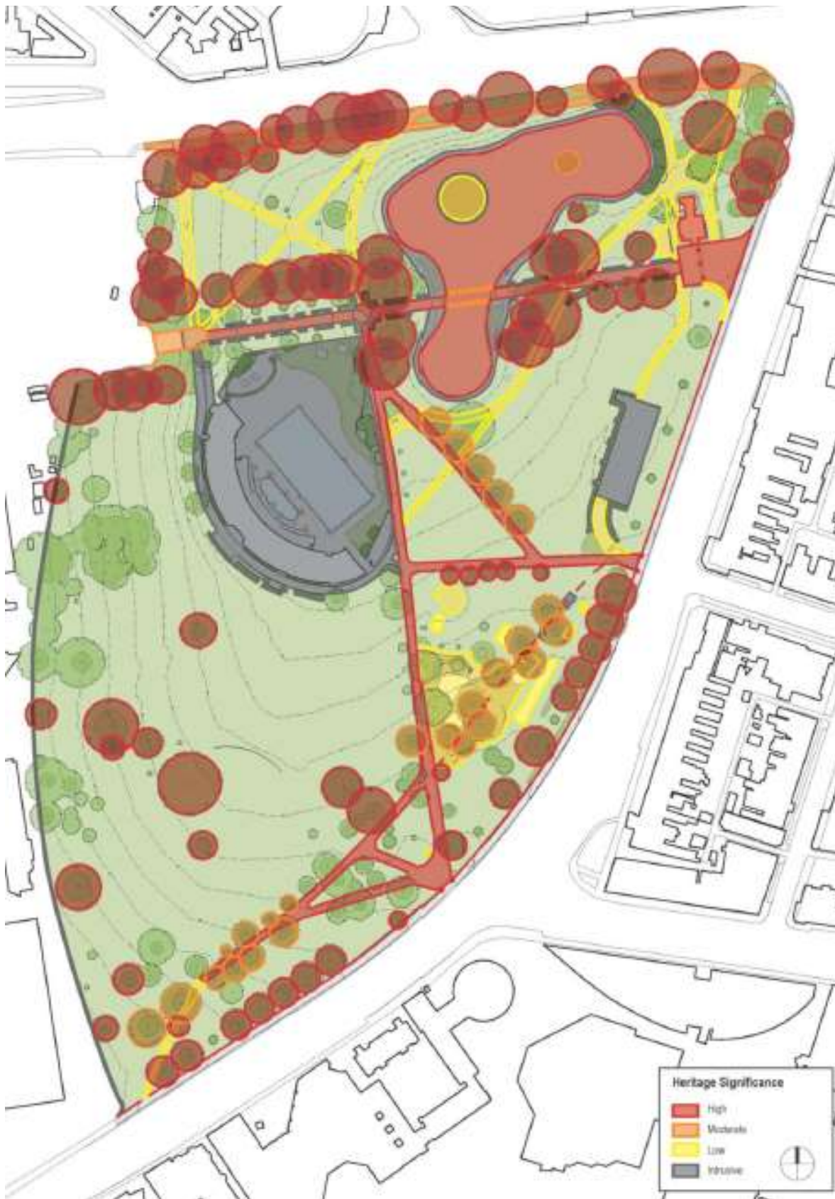
Figure 3. Heritage Significance of Victoria Park